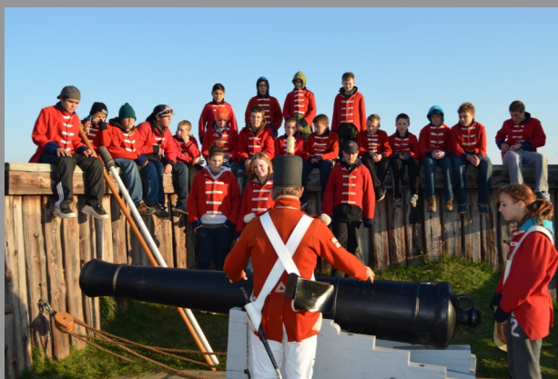
Learning to fire a cannon c1812