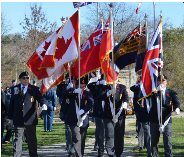
Remembrance Day ceremonies at the Glen