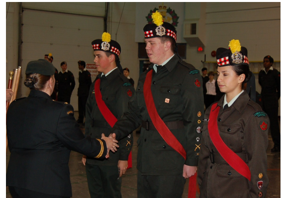
Promoted to Master Warrant Officers

Cadets in the 676 collected a total of 272 lbs of non perishable food in the 2011 Christmas food drive. All the food collected was donated to the Georgetown Bread Basket, a food bank for Georgetown residents located at 55 Sinclair Ave. The food drive was organized as a competition between the 4 platoons and the senior cadets. 2 Platoon collect the most food at 74 pounds. As the winner, 2 platoon will be excused from cleanup duties on parade nights until after March break. Thank you to all the families that participated in this years food drive.